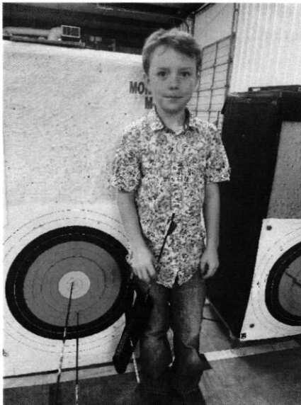
Sabine County 4-Her at District Indoor Archery Shoot