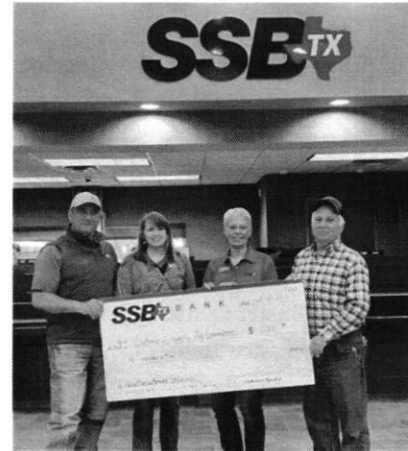
SSB Donation to the Ronald Barlow Memorial Scholarship