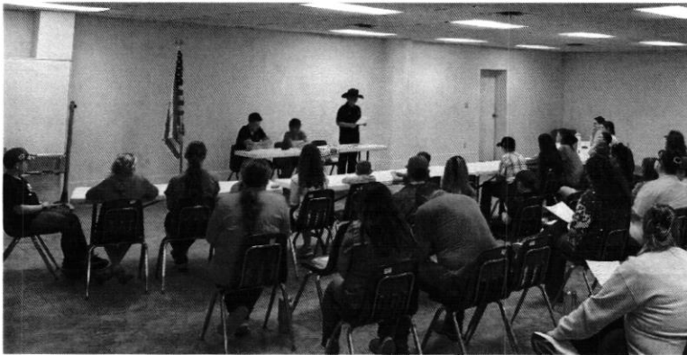
February 4-H Meeting

Educational programs of the Texas A&M AgrLife Extension Service are open to all people without regard to race, color, religion, sex, national origin, age, disability, genetic information, or veteran status